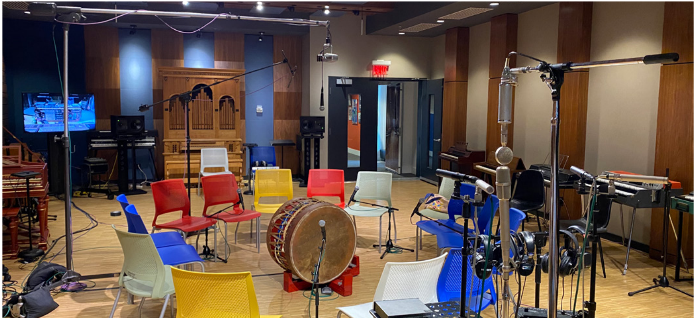
Northern Cree's set up to record in NMC's studios.