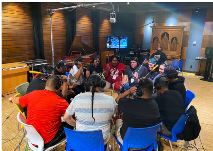
Northern Cree recording in NMC's studios.

More details are available at indigenousmusic.ca .