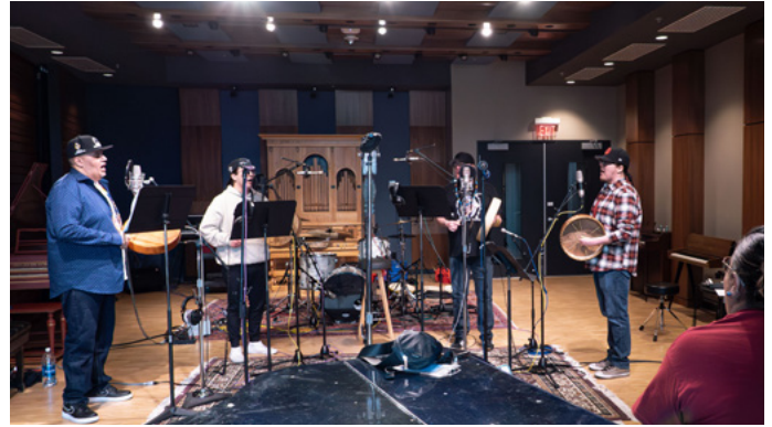
OHSOTO'KINO Recording Bursary recipients Warscout recording in NMC's studios.