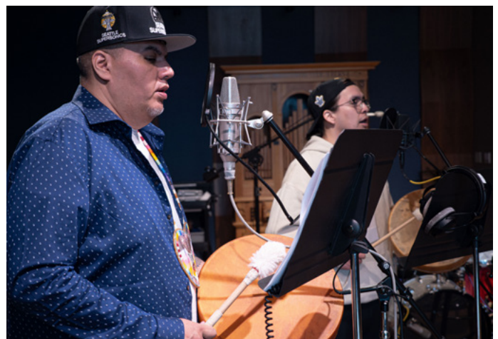
2024 Recording Bursary recipients Warscout in studio.