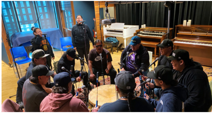
OHSOTO'KINO Recording Bursary participants the Blackstone Singers in NMC's recording studios.